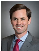
Senator Mayes Middleton

Senate District 11 Capitol Office: Room E2.712 512-463-0111 P.O. Box 2910 Austin, TX 78768