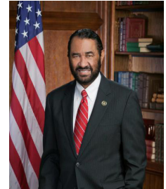
CONGRESSMAN AL GREEN

117 FM 59 Richmond, TX 77406 346-762-6600 nehls.house.gov