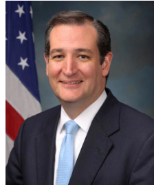
SENATOR TED CRUZ

5300 Memorial Dr, Ste 980 Houston, TX 77007 713-572-3337 cornyn.senate.gov/public/