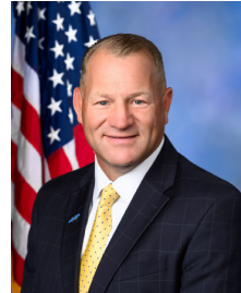
CONGRESSMAN TROY NEHLS

808 Travis St, Ste 1420 Houston, TX 77002 (713) 718-3057 cruz.senate.gov/