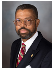
Senator Boris Miles

6117 Broadway St, Suite 122 Pearland, TX 77581 281-485-9800